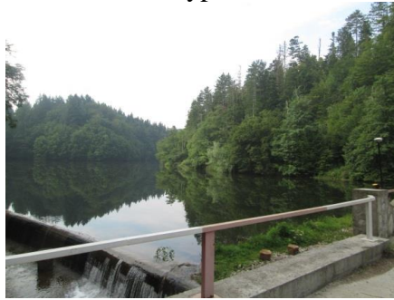
Figure 2 Buhui lake [18]

open channel to the entrance to the cave Buhui (Figure 3), where the flow is supplemented by Certej source, where Buhui flows by gravity to the filter, which is treated by disinfection with sodium hypochlorite, in 2 x 90m 3 existing tanks.