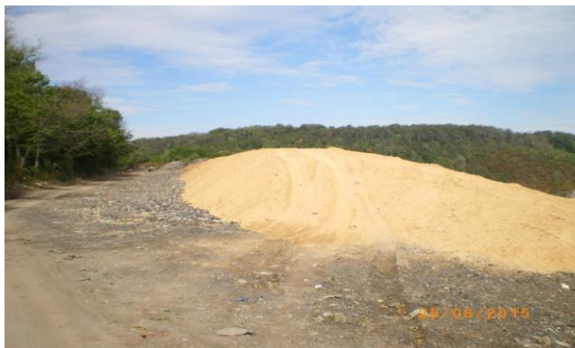
Figure 4 Anina waste deposit [3]

The local operator is Anina hall and the location of disposal is 35 km from Resita. The area is unsustainable in ecological terms due to: