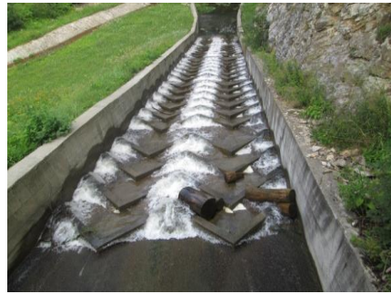
Figure 3 Freshwater gravitational channel [18]

The total length of simple distribution of drinking water is 47 km and is generally very old, there are also areas where it was replaced. There is no filtering devices and no appropriate treatment, it is necessary expansion and modernization of the system. Network management is performed by AQUACARAS SA Reșița - Anina workstation.[18] Other relevant data: