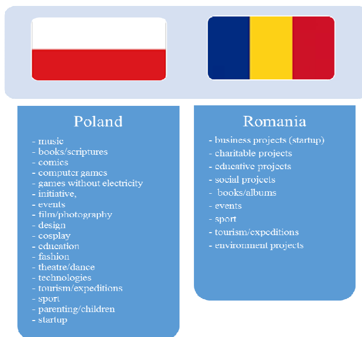
Figure 2 Main areas of projects funding through crowdfunding