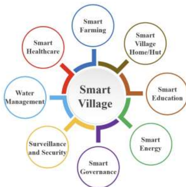
Picture 2 – Proposed projects contributing to the transition to a smart village of Dumbravița, Timiș County

Regarding the identification of the potential and possibilities for the transition of Dumbravița, Timiș County, to a smart village, I propose the implementation of several projects for: digital infrastructure, digital education and training, green energy and sustainability, access to health services, public transport mobility, promotion of tourism and local folklore, transition to smart agriculture, water management, video surveillance and digital security, smart governance [5].