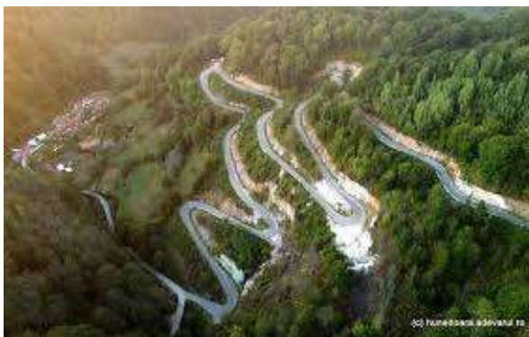
Figure 5. Transluncani - Western Transalpinia