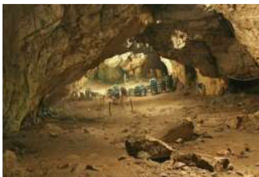
Figure 4. Românești Cave