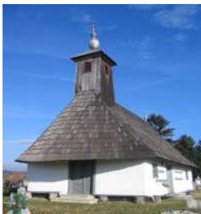
Figure 3. The “Cuvioasa Paraschiva” Wooden Church in Margina

- craft workshops and others (wood processing, weaving, traditional gastronomy) provide experiential tourism opportunities, allowing visitors to engage directly with local traditions and skills.