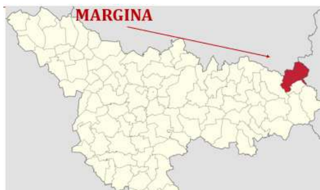
Figure 1. Location of Margina commune on the map of Timiș County

Geographical location. The commune of Margina is in the eastern part of Timiș county, on the limit with Hunedoara county. Its location at the contact between the Lugoj Plain and the hilly area of the Poienii Ruscăi foothills gives the locality a special identity, located at the intersection of the Banat and Transylvanian areas.