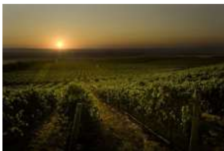
Figure 10. Recaş Vineyards

Wine has an old therapeutic symbolism – joy, relaxation, communion. In Recaş, wine tourism has become a complex experience: visitors discover the winemaking process, the story of the vineyards and taste local wines in a peaceful natural setting. This form of local tourism combines pleasure, education and relaxation, offering a "therapy through enjoyment".