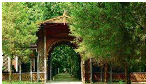
Figure 8. The colonnade of Buziaș