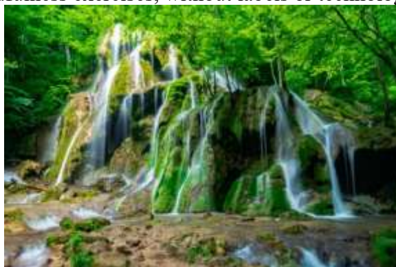
Figure 2. Beușnița Waterfall

The Nera Gorges, with the Beușnița waterfall and the Ochiul Beiului, are places that impress with their silence and color. The intense green of the forest, the turquoise of the waters and the silence of the birds create a state of deep calm. For the urban tourist, this experience is almost mystical: walking, breathing fresh air and contemplating nature become authentic mindfulness exercises, without labels or technologies.