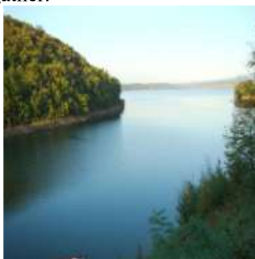
Figure 14. Surduc Lake

Surduc Lake is located in Timiș County and is a reservoir, being also the largest lake in western Romania, with an approximate area of 530 hectares. It's the place where you run away from the noise. Here, you can practice relaxation tourism, ecological fishing and reflection tourism – walks around the lake, picnics and bird watching. It is the ideal place for weekend tourism, where "you do nothing and yet everything happens": you breathe, you calm down, you gather.