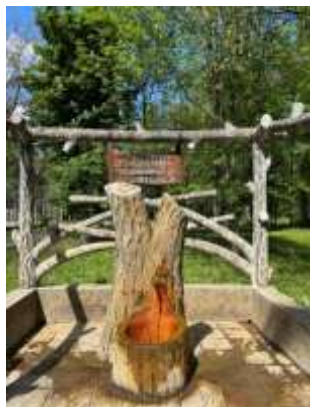
Figure 7. Buziaș

squirrels but also the old people playing backgammon under the colonnades offers an image of natural balance.