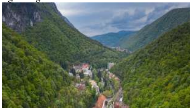
Figure 1. Panorama of Herculane Baths

The Baile Herculane resort, attested from the Roman period, is considered one of the oldest spa resorts in Europe. Its sulphurous thermal waters and mountain air create a unique combination for relaxation and restoration. Beyond the medical aspect, Herculane has a soothing energy, a special atmosphere: the old buildings, the Cerna River that flows gently and the mountains that surround it give the feeling that time has stopped. For many visitors, simply walking through its narrow streets becomes a form of emotional therapy.