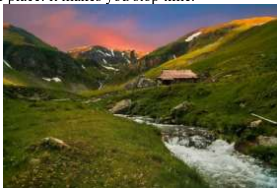
Figure 6. The painting of the Apple Glade

At the foot of Magura Mountain, the Apple Glade offers a picture that instantly soothes: the clear lake, the cold air and the smell of raw grass. Tourists come here for light hiking, waterfront walks, nature yoga, and meditation. A local says: "Around here, the clouds also stop for a moment, to breathe." This poetic image perfectly captures the therapeutic effect of the place: it makes you stop time.