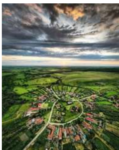
Figure 9. The circle-shaped village

With an atypical name for a settlement in Romania, the village of Charlottenburg or Șarlota in Timiș stands out for the shape of its settlement in the shape of a circle. Declared a historical monument, the village retains the air of an era long over. At every step a deep silence follows you, letting you discover the interesting history of the place. [10] The main tourist attractions in the circular village of Timis are the few remaining secular mulberry trees, the Swabian houses, the hunting grounds, but also the Roman-Catholic church of the village. You can spend a few days in complete silence, admire the surroundings and enjoy the simplicity of the village. [10] Charlottenburg, the only round village in Romania, is a lesson in the geometric harmony of rural life. From the center of the village, all roads lead in a circle, as a metaphor for the return. The white houses, the manicured gardens and the complete silence create an ideal space for contemplative tourism and slow-travel. Visitors come here for photo tourism, walks and retreat, and many say that in Charlottenburg "you heal from the chaos of the modern world".