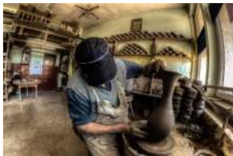
Figure 12. Pottery in Margina