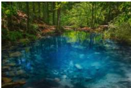
Figure 3. Ochiul Beiului Lake