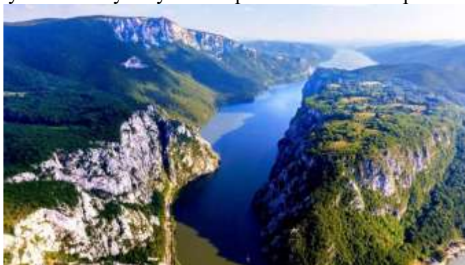
Figure 4. Panorama of the Danube Gorge

The Danube Gorge or Danube Gorge is a geographical region located along the north bank of the Danube, in the south of Banat. [4] The region, which is located on the territories of Caraș-Severin and Mehedinți counties, is bordered by the Nera River to the northwest and the Danube Boilers to the east. Spectacular from a geographical point of view, the area is also very important from the point of view of biodiversity, within it there are an important number of nature reserves, currently included in the Iron Gates Natural Park. [28] The Clisurii area, with the localities of Dubova, Svinița and Eșelnița, offers a quiet, contemplative tourism. The Danube, with its imposing gorge, creates a landscape that inspires respect and humility. The monasteries of Mraconia and St. Anne are spiritual retreats, where many tourists say they feel "a peace that is not explained, but lived."