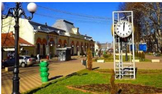
Figure 13. Făget

Around the town of Făget there are villages that retain a rare authenticity: Bunea Mare, Curtea, Zolt, located right at the northern foot of the Poiana Ruscă massif. [14] Here tourists can take carriage rides, listen to stories by the fire, taste fasting dishes, or learn how to make "homemade butter whipped with stories". In these villages, time melts. People say, "Whoever comes here forgets his watch, but remembers life."