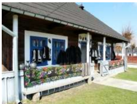
Figure 11. Traditional crafts from Margina

The commune of Margina, with its old villages, has become a model of authentic rural tourism. Located in the north-east of Timiș County, tourists can participate in bread-baking, pottery, weaving, opinci making workshops and tasting traditional products. It is a form of therapy through gentle work that relaxes and gives meaning. A local woman relates: "When you knead the dough, you also knead your thoughts, and your soul is smoothed." Margina offers not only tourism, but a school of patience. It's the place where time stops for a second.