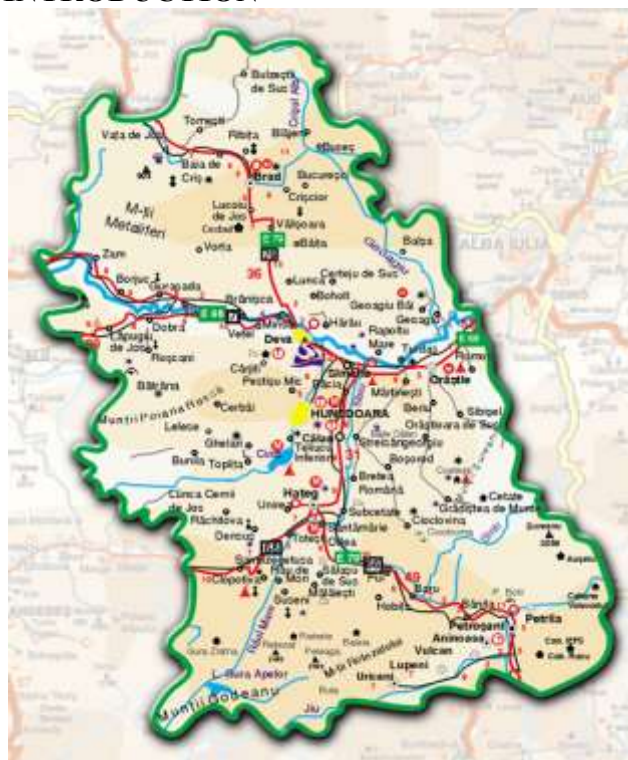
Figure 1. Hunedoara County's map

Hunedoara County is located in the southwestern part of Transylvania and occupies part of the watersheds of the Mureș and Jiu rivers. The county is intersected by the parallel of 46° north latitude and the meridian of 23° west longitude (published absolute values 46°16' north latitude, Bulzești locality, 23°24' east longitude (Aurel Vlaicu locality, 45°19' east longitude, Parâng Mountains). The extreme points of Hunedoara County, without indicating the absolute coordinates, are: the NW area of the village of Rusești (Bulzeștii de Sus commune) to the north, the western border of the village of Pojoga (Zam commune), to the west, the sources of the Lăpușnic river, to the south, and the branches of some right tributaries of the Jieț stream, to the east.