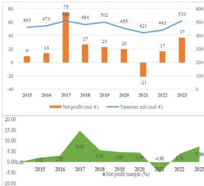
Figure 2. Main financial indicators of Romanian pig farming companies

These companies generated a cumulative net turnover of 510,429,168 euros and a total net profit of 37,203,496 euros (Figure 2).