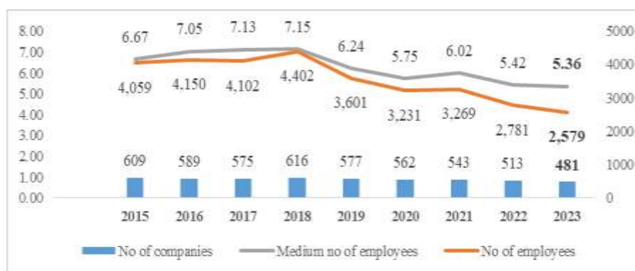
Figure 1. Evolution of Romanian pig farming companies

The pig farming sector in Romania has demonstrated robust financial performance in recent years. In 2023, 481 companies were registered whose main activity is pig farming - CAEN Code 0146 (Figure 1) [5,11, 14].