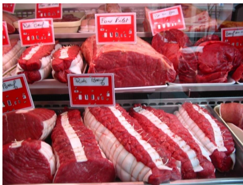
Figure 1. Boneless and almost fat-free beef from a French butcher

In a French survey [7], one of the main comments about beef was the fat content of the meat. According to European tastes, a minimum fat content of 3-4% is necessary for the meat to be properly tasty and juicy. Fat also plays a key role in the crumbliness of meat. However, unlike other species, it is easy to remove the intermuscular and subcutaneous fat during the preparation of certain parts (e.g. ribs) (Figure 1). This method can significantly reduce the fat content of a piece of meat. In reality, beef accounts for only about 5% of people's dietary fat intake in France. It would be an exaggeration to consider such beef as having a high fat content, since the consumption of cuts of beef thoroughly "stripped" (heavily freed from intermuscular fat) represents the minimum source of daily fat intake in the entire diet. A daily intake of 300 mg of cholesterol does not yet cause harmful effects. The cholesterol content of most types of meat is no more than this (for example, lean pork: 68 mg/100 g; lean beef: 75 mg/100 g; poultry: 38 mg/100 g). The cholesterol content of game meats is typically between 58-80 mg/100 g. Cholesterol is an extremely important component of membranes, some hormones and neurons. A low cholesterol level causes aggressiveness, increased tendency to accidents, deteriorating cognitive abilities (memory, reaction time, etc.) and depression [8].