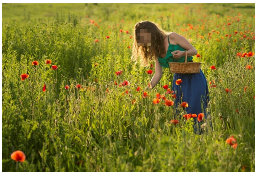
Figure 4. Collection of spontaneous flora products (source: https://camaradintotesti.wordpress.com [8])

The raw material used in the manufacture of these products comes from its own garden, where it does not use pesticides, from the peasant gardens in the area, which also do not use pesticides and from the spontaneous flora of the Retezat Mountains. As a fertilizer, use only compost produced in your own household, thus trying to obtain products that are as natural as possible.