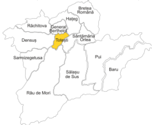
Figure 1. The location of Totești commune area in “Hateg Country”

Immediately after the town of Hațeg in Hunedoara, on the road to the town of Caransebeș in the neighboring county of Caraș-Severin, somewhere at the foot of Retezat, where the Roman road is supposed to have once passed, is the commune of Totești. With a population of 1,946 inhabitants, according to the 2002 population census, and with an area of 2,203 hectares, the commune is a transit area to the Retezat Mountains and it is composed of five villages: Cârnești, Copaci, Păclișa, Rea and Totești [14, 16].