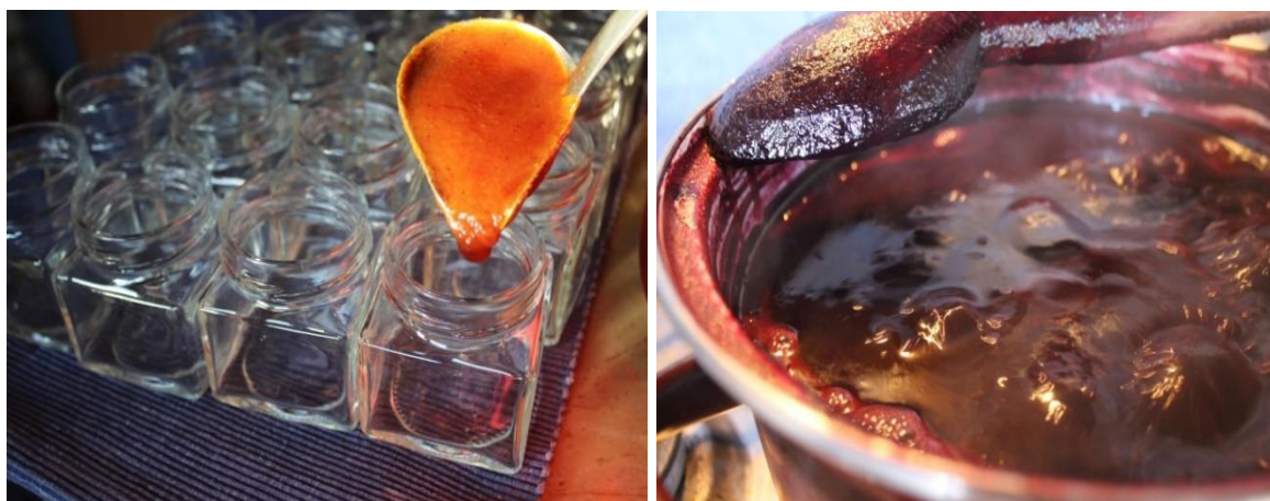
Figure 5. Processing of products offered by "Cămara din Totești"

In order to market the production, the Bora family authorized their kitchen to certify the food safety of the products, their marketing being carried out on the basis of the producer certificate obtained from Totești City Hall.