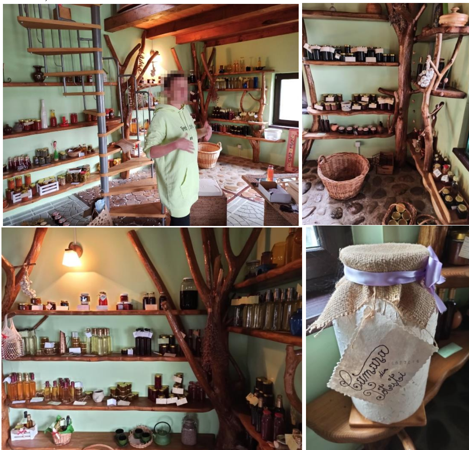
Figure 3. Products marketed by "Cămara din Totești"