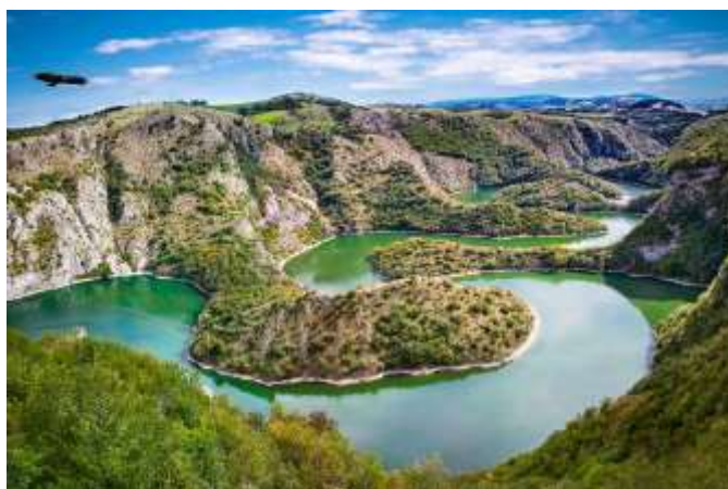
Figure 4. Special nature reserve Uvac, Serbia