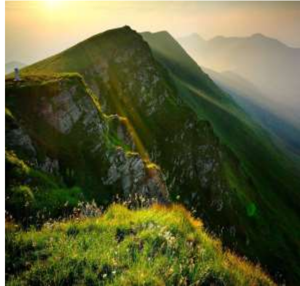
Figure 2. Nature park "Stara planina", Serbia

According to Robert Chambers: rural development is a strategy that enables a certain group of people, poor rural women and men, to get more for themselves and their children than they want and need. It includes assistance to the poorest among those seeking livelihoods in rural areas. The group includes small farmers, people without property and people without land. [3]