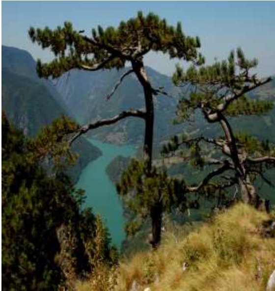
Figure 1. National park "Tara", Serbia