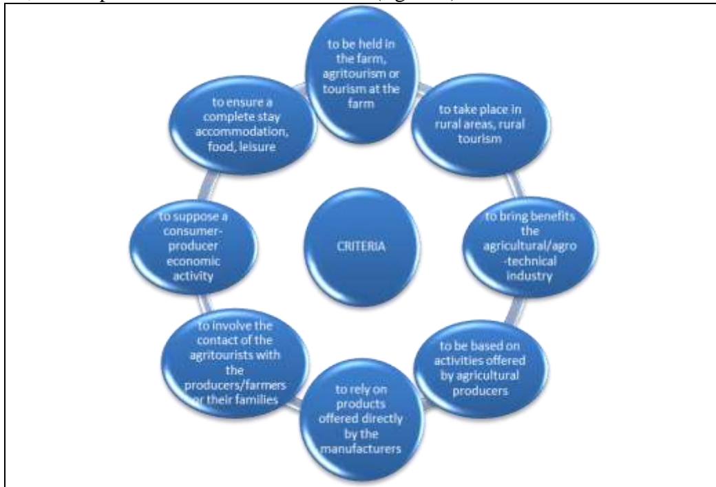
Figure 2. Criteria specific to rural tourism and agritourism

The activities classified as being specific to the field of agritourism and rural tourism, it is imperative to fulfill some criteria (figure 2):