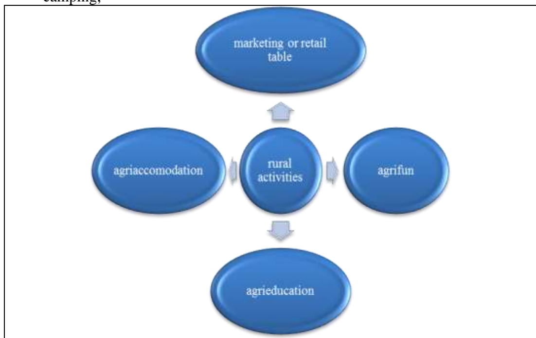
Figure 3. Classification of rural activities

Rural tourism, at national level, differs from agritourism, because the activities: