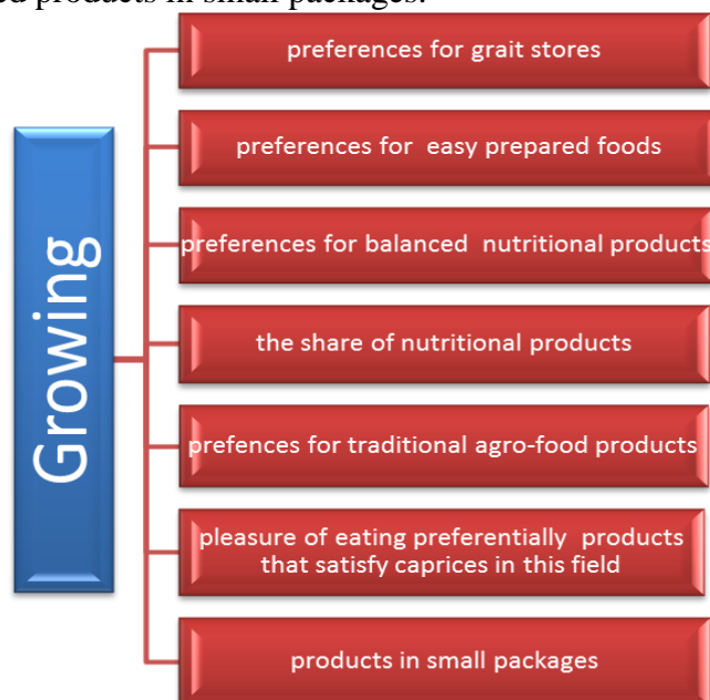
Figure 1. Changes occurred in European consumer's behavior