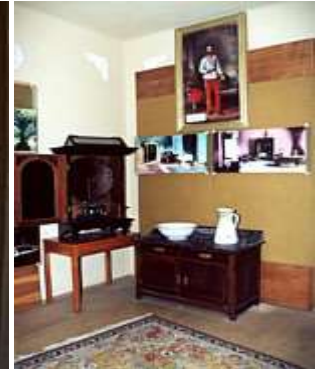
Balnear Museum in Buziaș