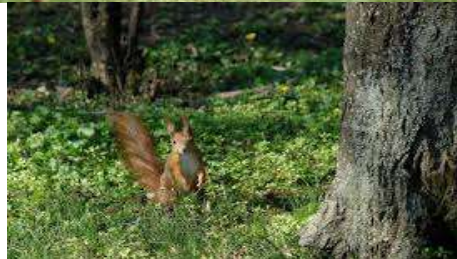
Arboretum park in Buziaş