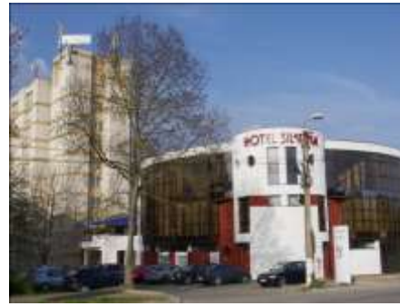
Hotel Silvana **