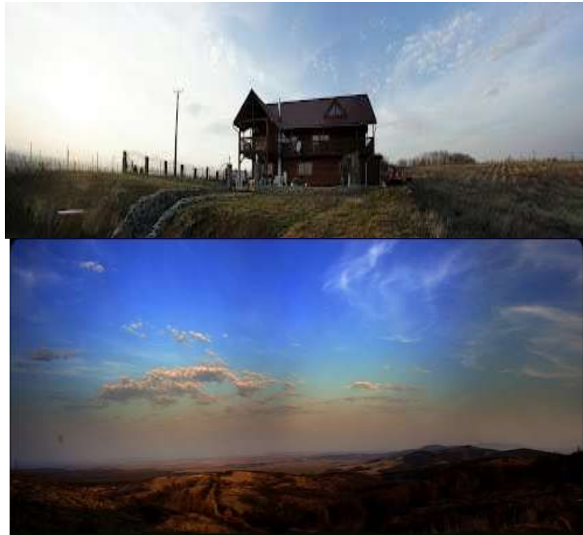
Surroundings, Silagiu Hills