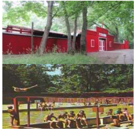
Mineral water pool