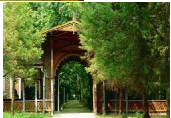
Colonnade from Buzias