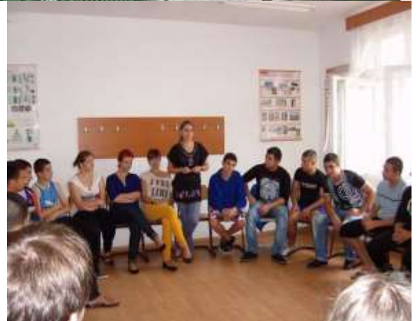
Rehabilitation Center Buziaș