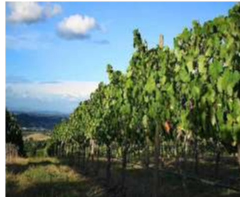
Dealul Dorului winery