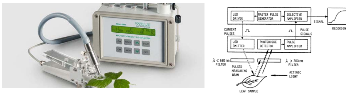
Figure 4: MINI-PAM Photosynthesis yield analyzer and the schematic view of the PAM measuring principle