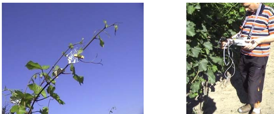
Figure 6: Dark adapted leaves and the measurement process