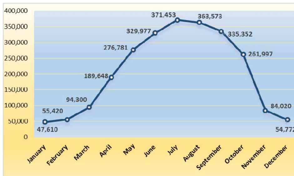
Fig 2 Seasonality of tourist flow in Cyprus (2012)

Due to the Mediterranean climate, the tourist season lasts seven months, from April to October inclusive, with the seasonal peak recorded in July (371,453 foreign tourists). During the cold season (November to March), Cyprus receives about 50,000 tourists per month (fig 2).