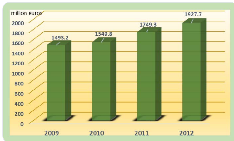
Fig 4 Receipts from international tourism in Cyprus in 2009-2012

The receipts from international tourism reach 1.5 -2 billion annually (fig 4), with growth rates exceeding 10% per year: 1.493 billion euros in 2009, 1.549 billion euros in 2010, 1.749 billion euros in 2011 and 1.928 billion euros in 2012.