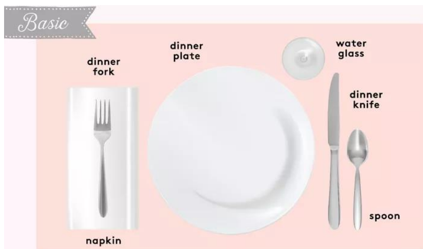
Figure 1. Basic table setting