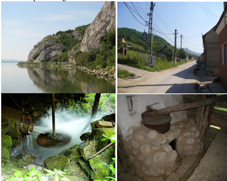
Sichevita Locality – representative elements

Attested in a document in 1363, the locality (see picture above) is mentioned continuously in all the following years, so that in the middle of the 18th century part of the village population settled in other places in the immediate vicinity, thus giving the current configuration of the commune with its 17 villages belonging to Gornea and Sichevita. The territory being initially covered with forests, the inhabitants made massive deforestation in order to be able to practice agriculture.