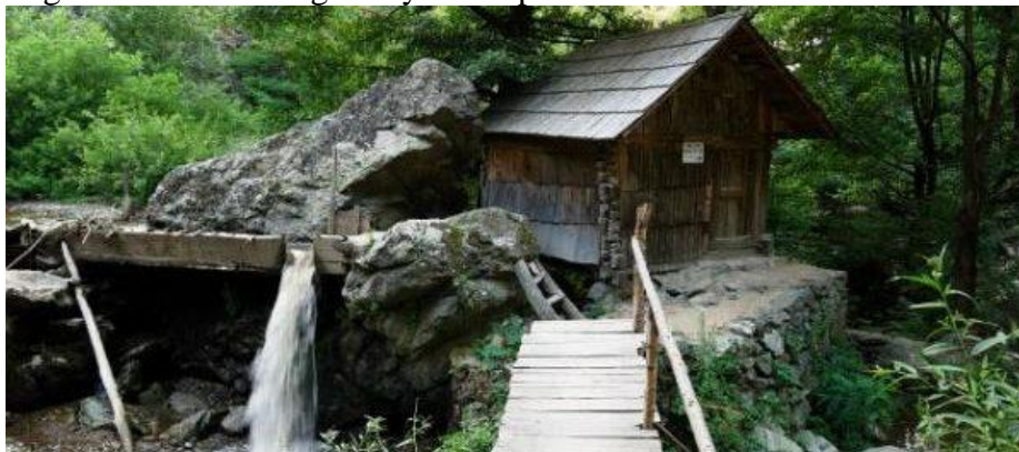
Sichevita old mill

Tourist leisure is perhaps the most disadvantaged element in general within the tourism product. But also, from this point of view, Sichevita area is very well equipped. Country life requires a certain simplicity and why not originality. Of great importance, regarding the animation specific to agritourism product, is the nature of the services, why not specific crafts or handicraft activities (spinning, weaving, milling, etc.), preserved over time, which give charm and originality to the product.