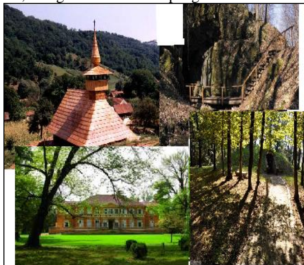
Important objectives from Savarsin

Savarsin. According to official information, it is located at the foot of the Metaliferi Mountains, at their contact with the Mures Corridor. The economic potential of the commune is extremely high. In the commune's economy, agriculture, forestry, the wood industry, the construction materials industry represented by the granite (Savarsin) and marble (Caprioara) exploitations, the extractive industry represented by the molybdenite exploitations (Troaș) and tourism have important weights. The tourist fund of the commune is an exception: