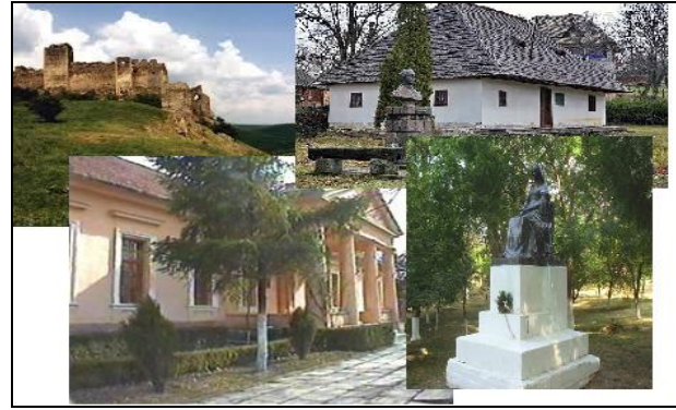
Important objectives from Siria

The locality was included in the guide "The most beautiful villages from Romania", the inclusion in this guide means, in addition to the recognition of the authentic beauties, and the chance to be promoted as tourist villages. An advantage of the commune is the fact that it is located on the Wine Road. At the commune level, there are rural tourist accommodation structures.