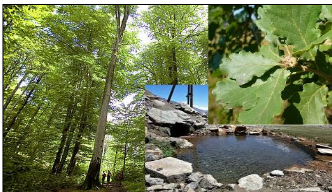
Natural objectives from Siria

The Sic Forest natural reserves, covering an area of 17.8 ha and the Downy Oak Forest covering an area of 2.1 ha, to which the thermal water springs are added, are the most important tourist attractions of the commune.