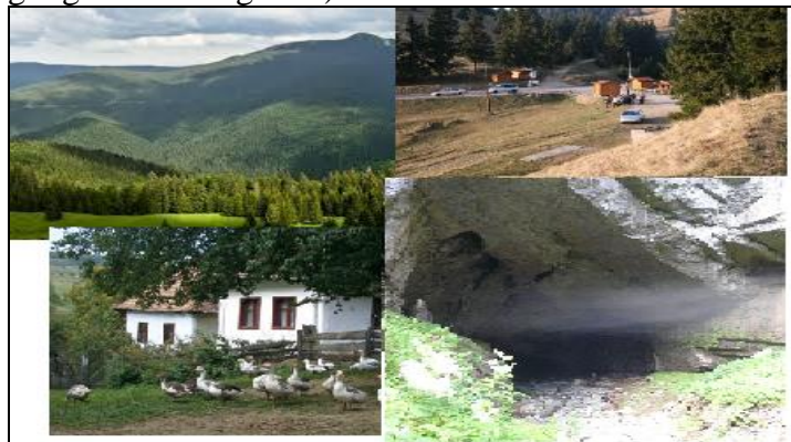
Important objectives from Hasmas

Hasmas. From an ethnographic point of view, Hasmas commune falls within the ethnographic area of the Apuseni Mountains, at the interference between Banat and Bihor. There are hunting lodges and guesthouses as accommodation structures in the area.