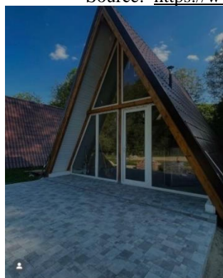
Figura 7. By The Forest Valea Verde Hut

Source: https://www.facebook.com/transylvanialogcabins/ [19]