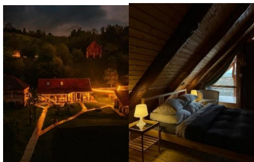
Figure 7. Guest house Transylvania Log Cabin, Peșteana