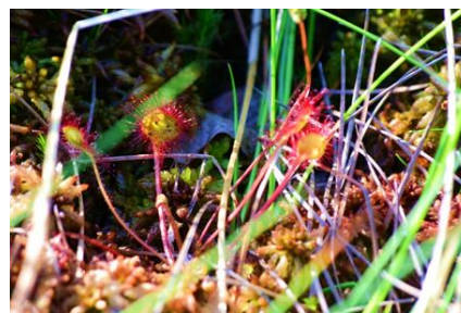
Figure 3. The Wheel of the Sky at Peșteana Botanical Reserve