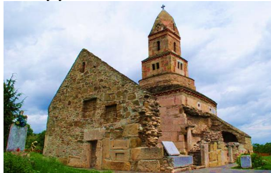
Figure 1. St. Nicholas Church in Densuș

The main type of tourism practised in the area of Densuș is cultural, represented by the existence of the historical monument " St. Nicholas Church " in Densuș, defined by the locals as "a Romanian medieval architectural jewel", being one of the oldest churches in Romania, listed by UNESCO as a universal cultural heritage site. It can be said that the building was built in the 13 th century in the Romanesque style. Today, the church is an architectural monument visited by dozens of tourists every year.[10, 15]