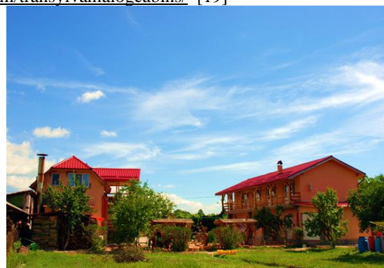
Figura 8. Criss din Densuș House