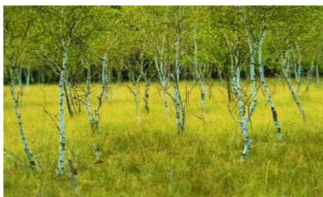
Figure 2. The Bottomless Pit at Peșteana