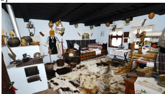
Figure 6. Ethnographic Museum from Peșteana

The Hațegan Village Museum in Peșteana , housed in a traditional wooden house, was founded ten years ago by Anton Socaciu with the aim of welcoming tourists interested in learning about the history and ancient customs of a rural area in the Hațeg region. The objects exhibited in the museum were bought from the inhabitants of Peșteana village or were given to the museum by various people over the years. Inside the museum, there are folk costumes, books and documents from the Hațeg region, coins and banknotes, objects rarely found today from the peasant's kitchen, sewing machines and other iron materials that remind of the exploitations that took place in this area. [5,6]