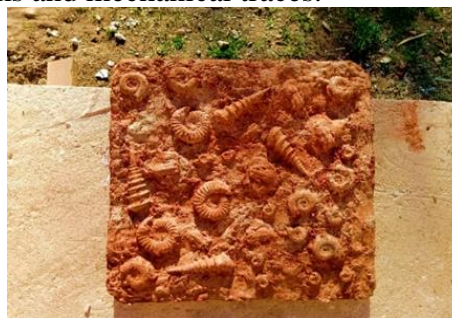
Figure 5. Fossil traces

The Hațegan Village Museum in Peșteana , housed in a traditional wooden house, was founded ten years ago by Anton Socaciu with the aim of welcoming tourists interested in learning about the history and ancient customs of a rural area in the Hațeg region. The objects exhibited in the museum were bought from the inhabitants of Peșteana village or were given to the museum by various people over the years. Inside the museum, there are folk costumes, books and documents from the Hațeg region, coins and banknotes, objects rarely found today from the peasant's kitchen, sewing machines and other iron materials that remind of the exploitations that took place in this area. [5,6]