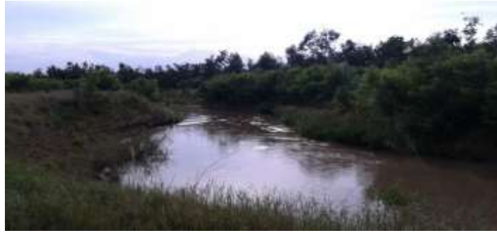
Figure. 4. Pogăniș River