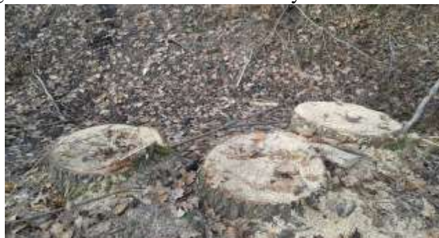
Figure 6. Thefts of secular trees from Pogăniș Meadow (from own property)

Over time, many trees have been allowed to grow by the owners, so that they can be cut and used for heating in the winter. What's sad is that they cut more than necessary for the sale. Without control over the reservation, cutting down excessively, not just the owners, and clearing almost the entire area covered by trees.