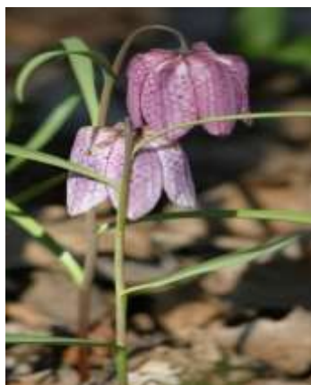
Figure 3. Fritillaria Meleagris(the Variegated Tulip)

The natural area protects, through the Bern Convention, a rare floristic species, known under the popular name of the variegated tulip ( Fritillaria meleagris ), a rare plant, but native to Eurasia.