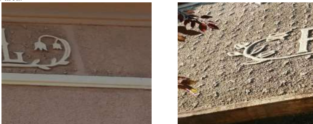
Figure 7. Model of Variegated Tulip on the houses from Berini village, Timiș county

As a result of these deforestations, several species of flowers have either disappeared or are seen less often, especially the variegated tulip, which is the symbol of this area.