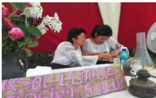
Figure 9. Activities of Pogăniș Meadow NGO