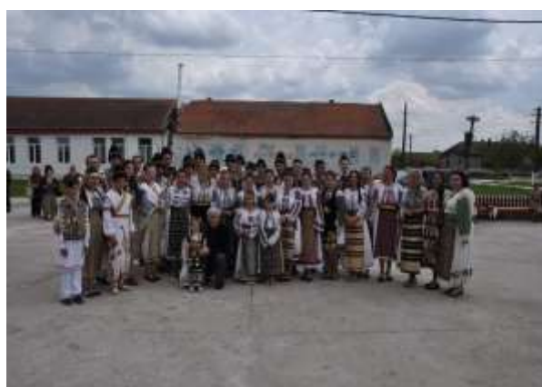
Figure 10. The first edition of event – "Mândru-i portu dân bătrâni"