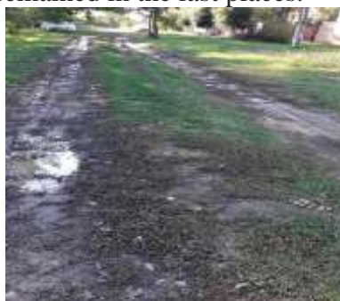
Figure 8. Impracticable roads from Sacoșu Turcesc village

In addition to the existing tourist potential, but still, in the unborn phase, there is a real heritage that lies in the homes of those who form the community of Berini. The lack of authorities to get involved in the life of the communities and the total disinterest towards the people living here, towards education, culture, made Sacoșu Turcesc remain anchored in the 1970s. Without a road infrastructure, the villages belonging to the commune have roads covered with stones, without a development strategy at the level of local administration, the commune remained in the last places.