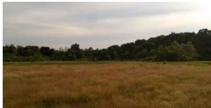
Figure. 5. Trees from Pogăniș Meadow

The relief is high plain combined with low plain. The alternations of the relief forms, as well as the accentuated interpenetrations of the two categories of plains, give rise to relief microforms such as plates, ridges, micro-depressions, undulations, dead arms, and meanders. As in the past, following the massive waterfalls, the Pogăniș River often came out of the riverbed, the vegetation grown on the river bank was allowed to grow, thus creating a natural dam. After the Turkish invasion these forests were cut down, thus opening a new period of floods that led to the formation of swamps in the area, but under the rule of the Austro-Hungarian Empire, a series of land improvement works were carried out, the traces of which it is preserved to this day as dams and drains. Today, Pogăniș Meadow is not managed by any state authority, the landowners have also own portions of the forests on the bank of Pogăniș [12].