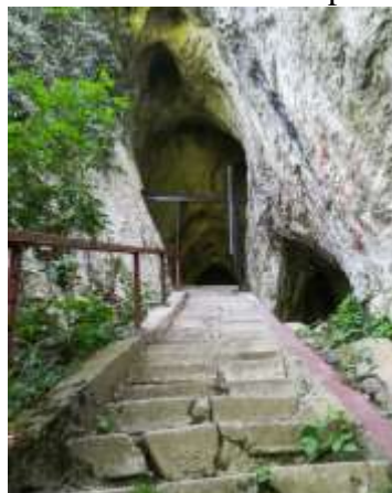
The steam cave

A cave from Cerna Mountains exits hot steam through cracks, and tourists are curious to see this natural wonder from Banat area. From the Baile Herculane resort to the Cave with steam it is about an hour to walk on mountain paths. On the route there are a few vantage points, a good opportunity to make short stops, to draw a strong ionized air in the chest and to admire the beautiful mountain landscapes.