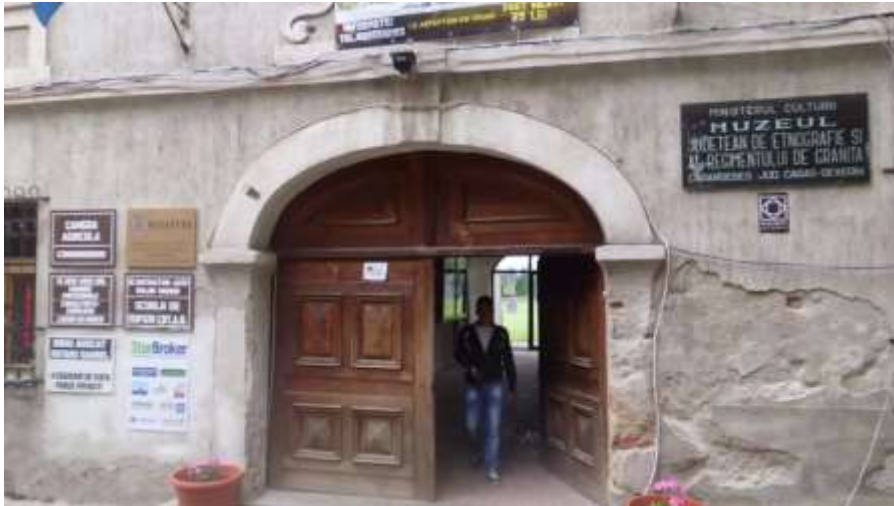
The Ethnography and The Regiment of The Border Museum from Caransebes