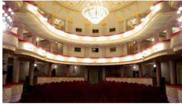
The Old Theatre „Mihai Eminescu” from Oravita

18:30 We leave for Timisoara 20:10 We arrive in Timisoara.