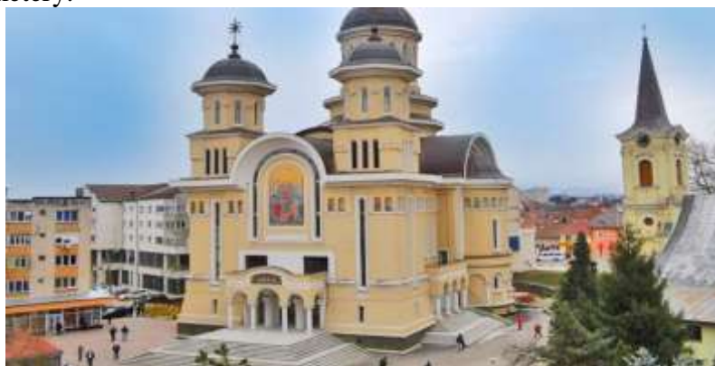
Orthodox Cathedral from Caransebes