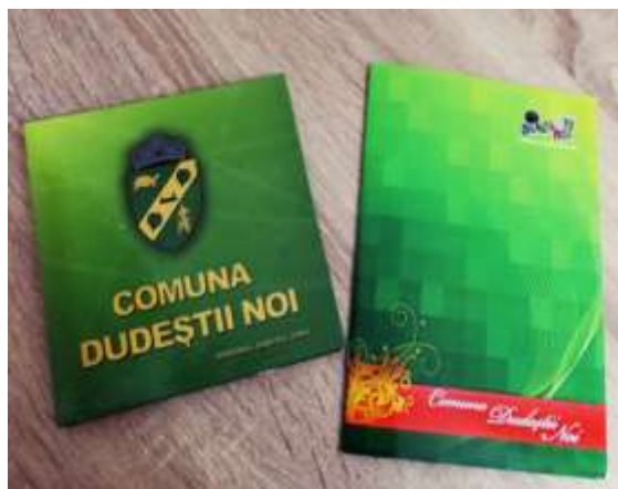
Fig. 3. Booklets promoting Dudeștii Noi commune

The first one is bilingual, has a smaller size, a square format. The cover is glossy and hard. The second one has a rectangular format, with 24 pages. (fig 3.)