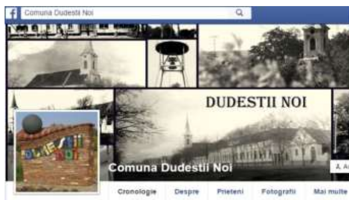
Fig. 8. Facebook page header Dudeștii Noi [4]

The Facebook page is connected with the official website of the local administration of Dudeștii Noi commune. (fig. 8)