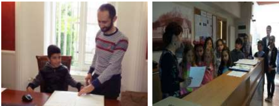
Fig.6. Open Doors Day at the Town Hall of Dudeștii Noi

They interacted with the employees of the local administration and with the mayor, who explained what activities they have and how to run a commune. The students have shown a vivid interest and involvement, offered by the competent staff of the town hall. (Fig. 6)