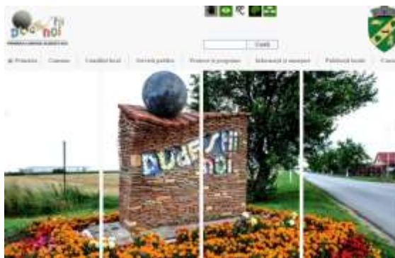
Fig. 7. Interface of the official website Dudeștii Noi [5]

The town hall and the local council of Dudeștii Noi have a Facebook page, where are posted updates, photos, suggestions, opinions. It is the place where the online community is connected, and are made aware of what is happening in their village.