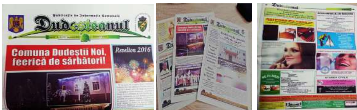
Fig. 1. Dudeșteanul Newspaper

The publication, which has 8 custom pages with brand marks (the emblem and logo of the commune on the first page), is distributed for free. The name of the newspaper has strong ties with the community, and contributes to the idea of communion. (fig. 1)