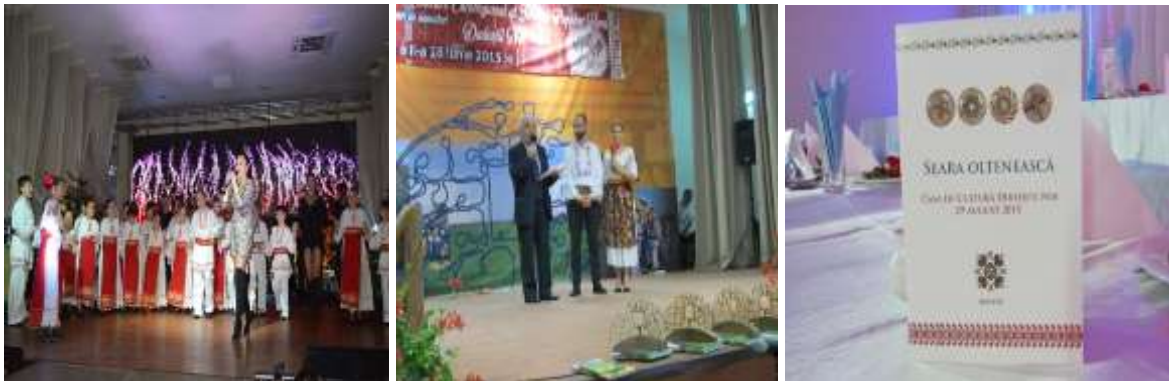
Fig. 5. Christmas concert with Andra. (Left) Popular game contest Hora. (Centre) Evening Oltenia (right) [5]

"Dudeșteana". In addition to this, they are maintaining an open communication between local administration and the community. (fig. 5)