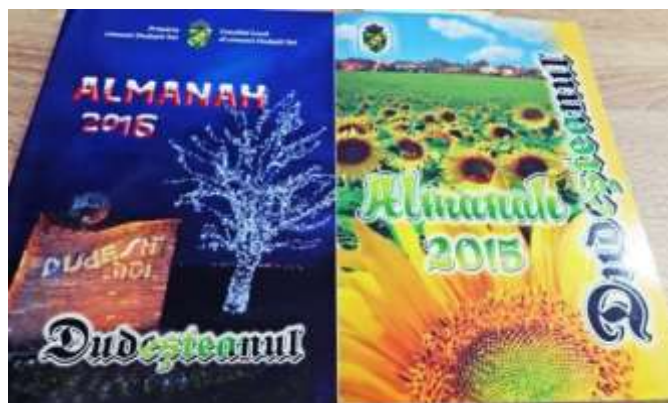
Fig. 2. 2016 Almanac Dudeșteanul from 2016 (left) and from 2015 (right)

• "Dudeșteanul" Year Book (almanac) is another printed communication by the Local Administration of Dudeștii Noi and brings together in one publication all articles published a year earlier in the newspaper Dudeșteanul. It has 292 pages, and is available at the beginning of each year, in the town hall, free of charge.